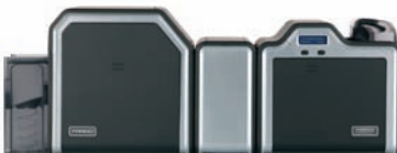
Lamination option and dual-sided printer/encoder

Modular design grows with your needs. Not sure what your ID card applications will require in the future? No problem. The HDP5000 is easily upgraded to fit your needs. Start with a basic single-sided unit. Install encoding modules. Upgrade to dual-sided printing. Add lamination, or simultaneous dual-sided lamination for the ultimate in card security and durability.